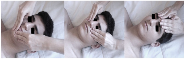
Figure 1. Proposed manual lymphatic drainage procedure performed in the drainage group. Face divided into three parts: inferior, medium and lower regions.